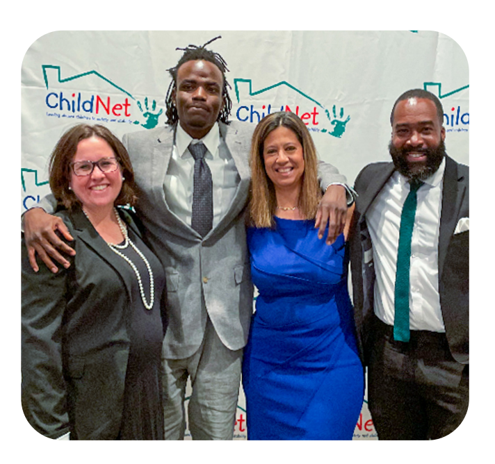
Team Growth = More Children and Families Served